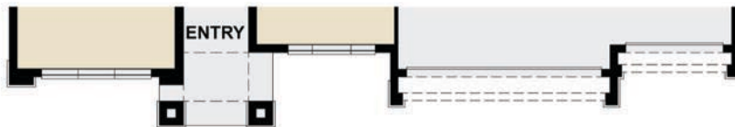
FIRST FLOOR C