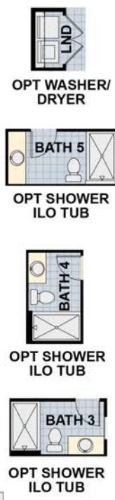
FIRST FLOOR A